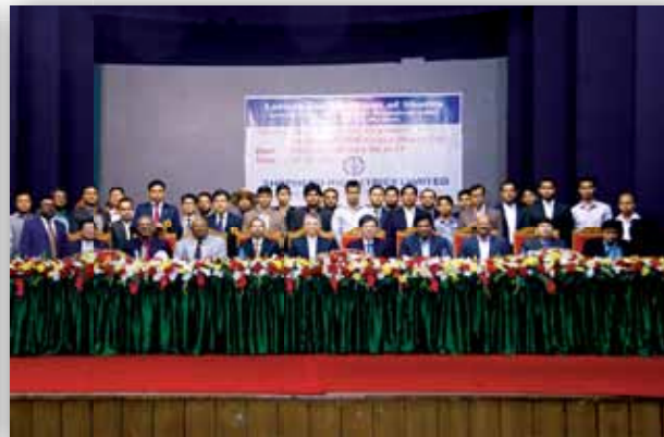
IPO Lottery Program