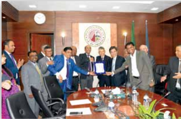
Crest Received form Dhaka Stock Exchange Ltd.