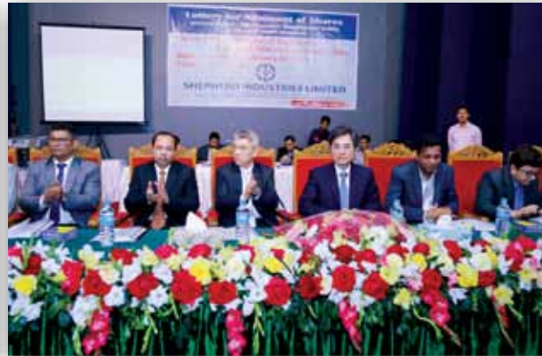
IPO Lottery Program