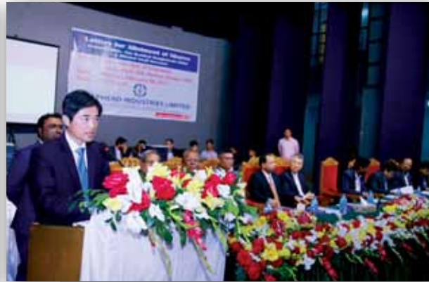
IPO Lottery Program