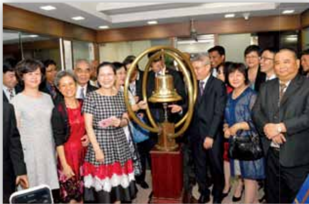
Ringing the Bell